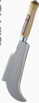
stafford bill hook