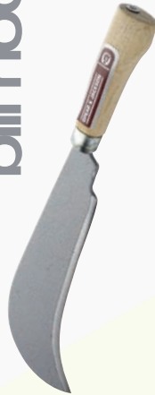
newton bill hook