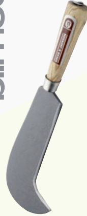
southern counties bill hook