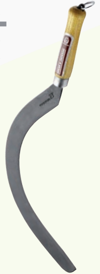
fussel bristol reap