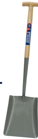
solid socket square mouth