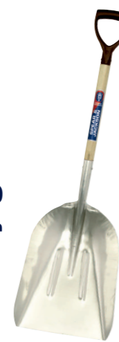
alloy grain shovel