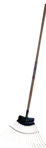
heavy duty rake