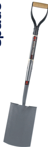
treaded digging spade