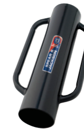
post hole rammer